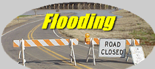
Flood Preparedness and Response / Construction / Military

Mr. Sandman™ also sells filled sandbags to meet your preparedness needs. Sandbags are palletized and shipped by truck. Place orders well in advance of need, as shipping may be delayed due to inclement weather. Minimum order—10,000 bags. Competitive pricing.